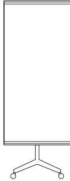
725 x 1960 x 500